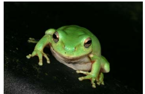
Green Tree Frog ( Litoria caerulea )