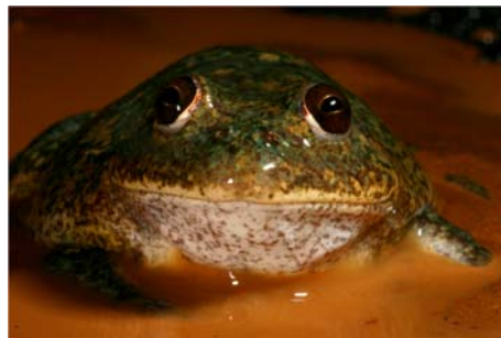
Waterholding Frog ( Cyclorana platycephala )