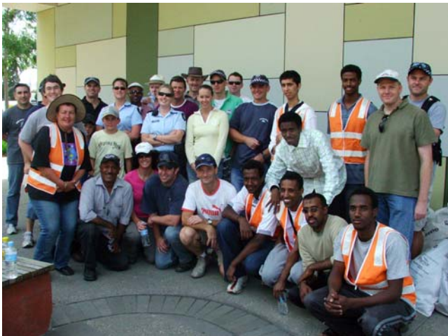
Clean Up 2007—Flemington and North Melbourne

The Staff and Committee members of Moonee Ponds Creek Co-ordination Committee invite you to join in the fun and help clean up Australia at one of our clean up sites along the Moonee Ponds Creek. Last year we collected a massive 450 bags of rubbish and are aiming for a record this year, but we need your help. So why not join in the fun and meet us at one of our sites?