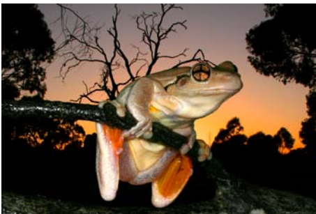
Peron's Tree Frog ( Litoria peronii )