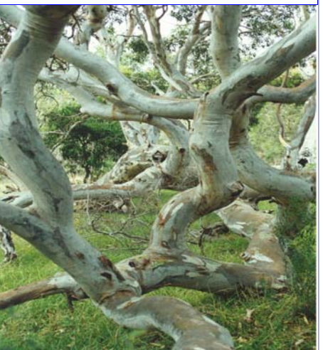
Ancient Redgums at Woodlands Historic Park.

For more information on Woodlands Historic Park ring Parks Victoria on 131963.