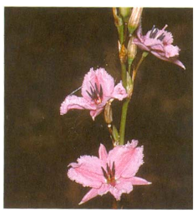
The beautiful Chocolate Lilly (Anthropodim strictum)