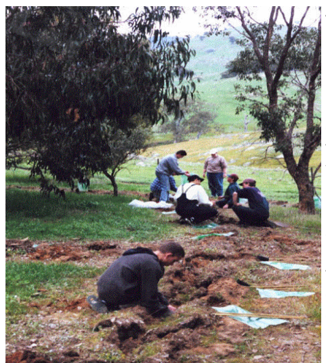
Penola students revegetating the creek

The Moonee Ponds Creek Community Greening Program (MPCCGP) is restoring the distinctive character of the creek through revegetation with local native plants. Local community groups, schools, and residents are planting a variety of trees, shrubs, and grasses all along the creeks length. The ultimate vision is to create a continuous habitat corridor. Since its inception in 1999, The Greening