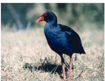
Purple Swamp Hen