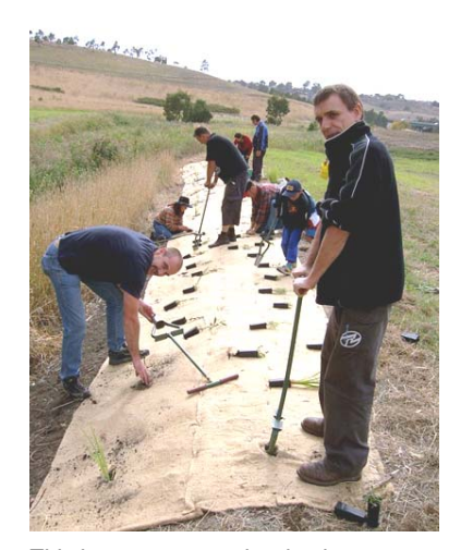
This happy crew are hard at it beautifying the Jacana Wetlands.

17 pairs of hands planted 200 tube stock into 3 jute matted areas alongside the Creek. They then reunited on the 23<sup>rd</sup> of May and 18 people continued planting and guarding 145 trees and shrubs in the Wallaby Area.