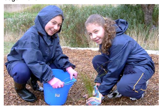
A little bit of rain didn't stop these waether -proof Lowther Hall girls

Lowther Hall was also involved with planting mulch beds at the Jacana Wetlands this season. With dark clouds looming on the horizon, the 40 grade 4 girls launched straight into the planting, getting all 310 tubestock into the ground in record time! A few spatters of rain didn't deter the students or the parents who were well equipped with gumboots &rain jackets. After doing a lap around the wetlands and recording many sights and features, the hungry team enjoyed a BBQ, finishing off just as the rain began to fall.