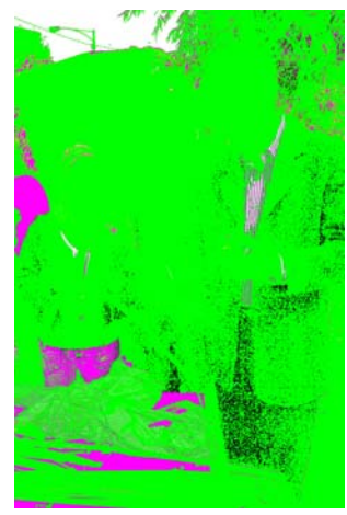
Kelvin Thomson watches how Cumbungi weaving is done by the professionals!

The CityLink Creek Connections program will run at least 12 activities throughout 2006 and 2007, targeting community members who face barriers