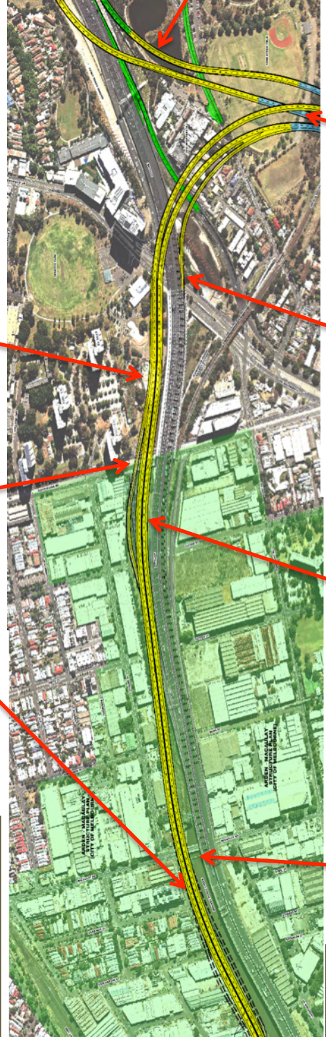
Proposed route of the East West Link connection with CityLink to the south (NOTE: NOT TO SCALE)

On the east side, the on-ramp starts just north of Royal Park, and stomps over the wetlands and the Ross Straw Fields