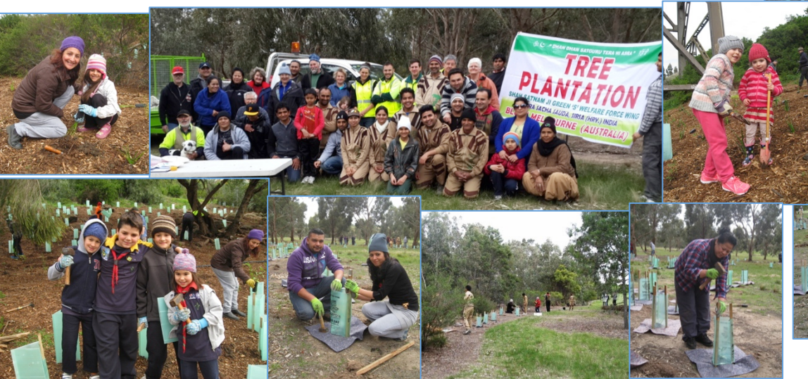
National Tree Day 2013 at The Tarnuk and Gowanbrae