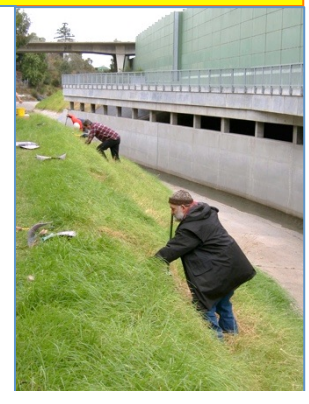
The Creek below Balfe St in May 2005, and October 2013