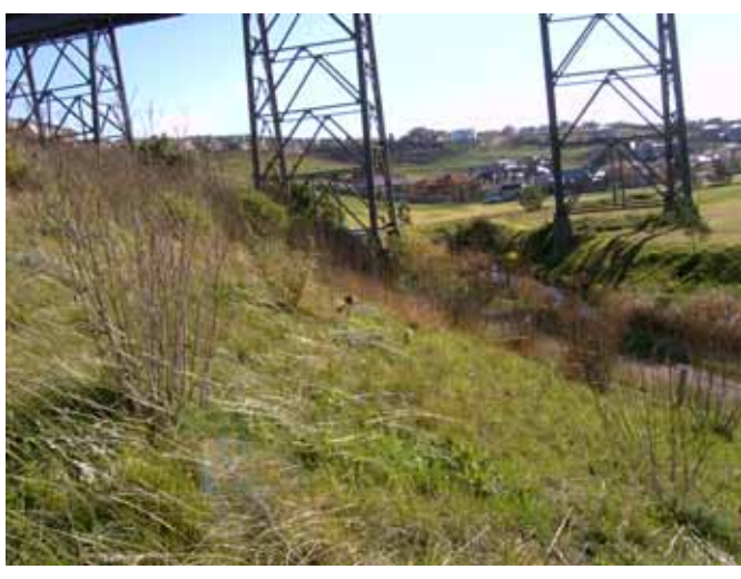
The grassland remnant in Boeing Reserve, Strathmore.

A small grassland remnant along the Moonee Ponds Creek in Strathmore is currently being rehabilitated and restored by the MPCCC Bushland Team. This project has been made possible by funding from the Landcare Grassroots Grant in 2005.