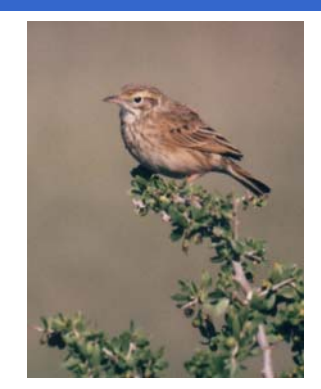
Australia (Richard's) Pipit

Fauna and flora observations along the Moonee Ponds Creek. To contribute contact the Newsletter Editor on 9333 2406 or ponderings@mpccc.org