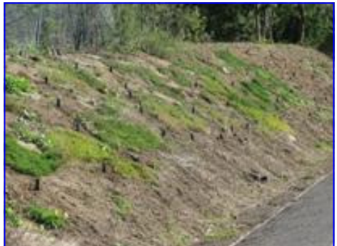
Strath-Oak Planters have been busy planting here at Brosnan Crescent

Debneys Park is also receiving a major upgrade with new play and recreations facilities, garden beds, trees and creek interface.