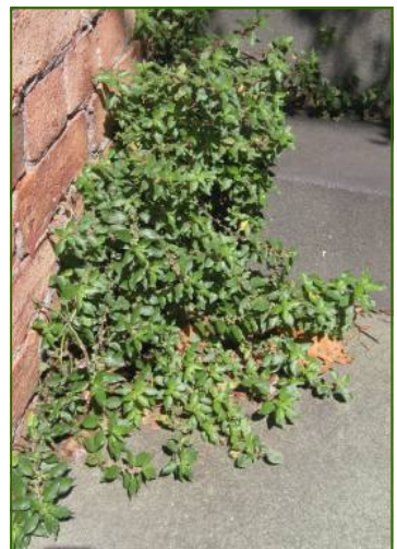
Asthma Weed growing in a crevice in Turner Street, Abbotsford, where it is well established.

Asthma Weed has been declared a noxious weed in NSW, let's try to prevent it from spreading here in Victoria.