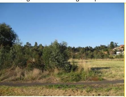
Looking east in April 2011