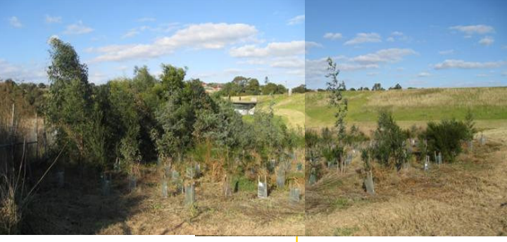
The same site in April 2011

Regular planting sessions with the Friends of Jacana Wetlands have transformed this valley. The increase in birdlife was almost immediate, noticeable less than two years after the work started. Local residents have noticed the increase in frog life too, with numerous frogs taking advantage of water in their gardens when the wetlands dry out between rain events.