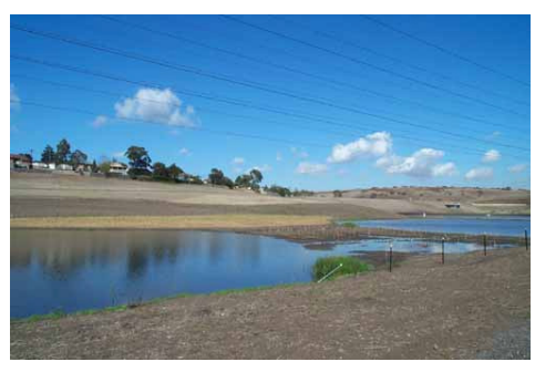
The new wetlands, 2002