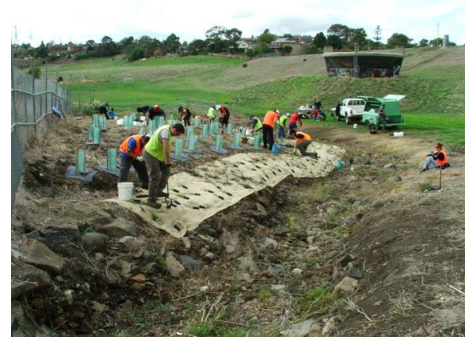
Planting at the spoon drain in May 2007

When work started at Jacana, in early 2002, it was little more than a broad shallow grassy valley, the Broadmeadows Retarding Basin, with the Moonee Ponds Creek curving down it. Today, there are corridors of trees along the Creek and skirting wetlands; and clumps of trees and shrubs providing shelter and habitat for the increased wildlife taking advantage of the new wetlands created by Melbourne Water. These wetlands were created to remove nitrogen and litter from the water flowing down Moonee Ponds Creek.