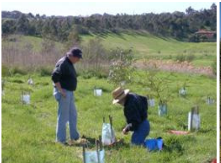
Looking east in September 2004