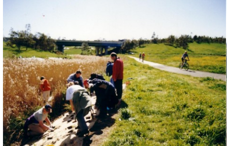
Looking north to the bridge in October 2003