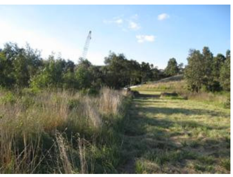
Looking north to the bridge in April 2011