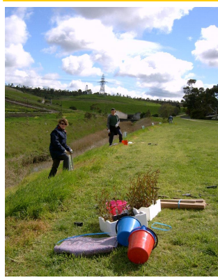
Looking north to Jacana in 2004 and in 2011

Over the past three issues, Ponderings has been celebrating the efforts of Friends groups along the Moonee Ponds Creek to transform their section of Creek-side vegetation. In this issue we have reached Gowanbrae and show the achievements of the Gowanbrae Residents group.