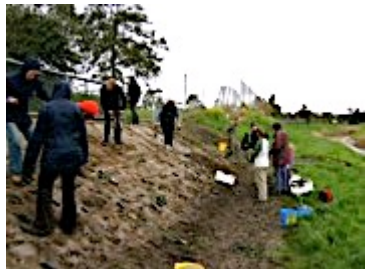
And the same views in October 2012