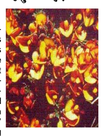
shrub. We will be giving away Eutaxia when you help out at planting days, amongst Eutaxia macrophylla

We are proud to introduce our second plant star: the Small Leaved or Common Eutaxia (Eutaxia microphylla). This robust little shrub (up to 1m high x 1m wide) is equally happy as a dense groundcover in your garden or in a large pot, as it is in its native grassland or red-gum woodland habitat. It loves a prune to promote a dense cover of red and orange pea flowers which create the appearance of a profuse carpet of flame from August through to October. Once it gets going this lovely shrub will tolerate most situations from periods of drought to waterlogging, however it really doesn't like shade. You could grow it in a rockery or on steeper parts of the garden and contrast it with other ornamental groundcovers such as Convolvulus cneorum which has blue bell flowers from October through summer. Or if you want to be strictly 'indig' you could try growing it with Wahlenbergia communis a native pale blue flowering