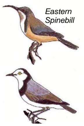
White Fronted Chat