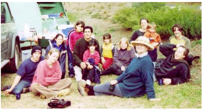
Phew! 250 plants in two hours. The Friends of Sacred Kingfisher finally relax for a sausage or two