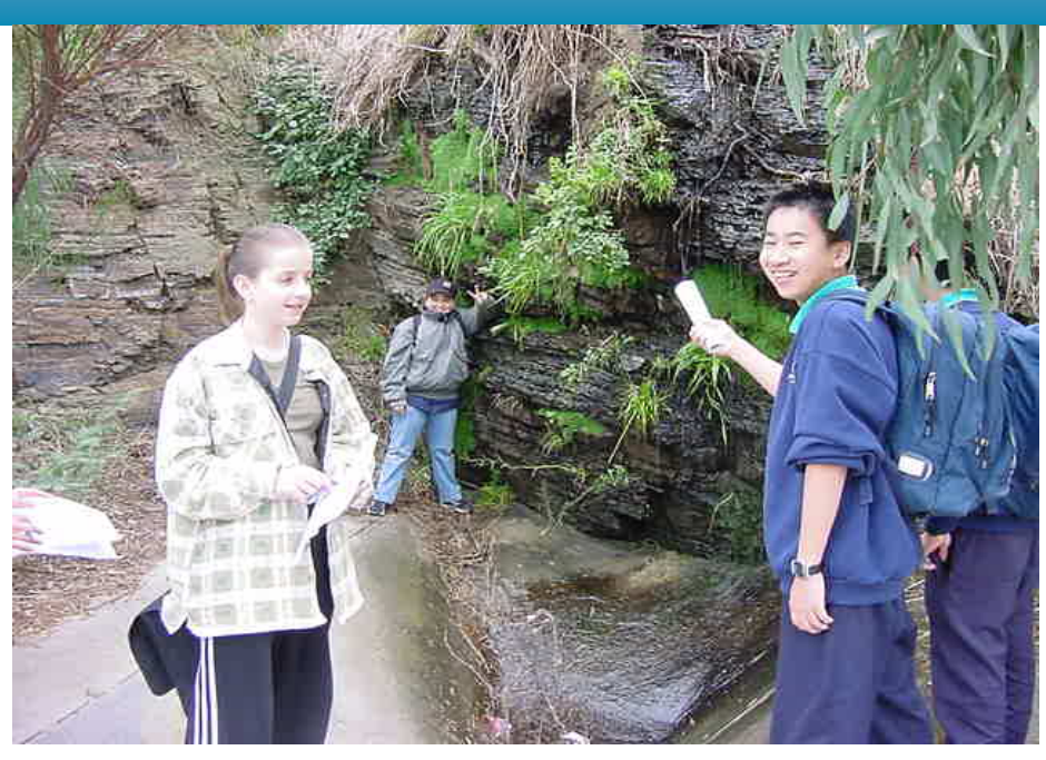
Students from Brunswick Secondary College volunteer to take care of a stretch of the creek.

I live in Moonee Ponds and I spend a bit of time cycling between there and the city. In particular the stretch between Flemington Road and Dawson