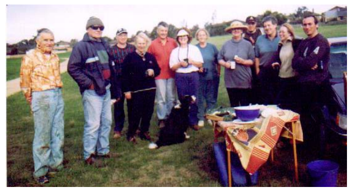
Friends of Upper Moonee Ponds Creek well rewarded for their efforts with fresh scones and lashings of cream.

Seventeen members of the Friends of Upper Moonee Ponds Creek in Westmeadows held a lovely planting afternoon within their rabbit proof fence area, despite the threatening rain clouds. Funded by Hume City council, 610 plants (including 550 speedlings) were planted. Yes, s'P'eedlings. Able to be planted into a hole created by a swift poke of a stake, speedlings are a wonderfully quick way to plant grasses. The only constraint is they dry out quickly, so are best suited for moist sites. Thanks to Julie and Kim for those yummy scrummy scones!