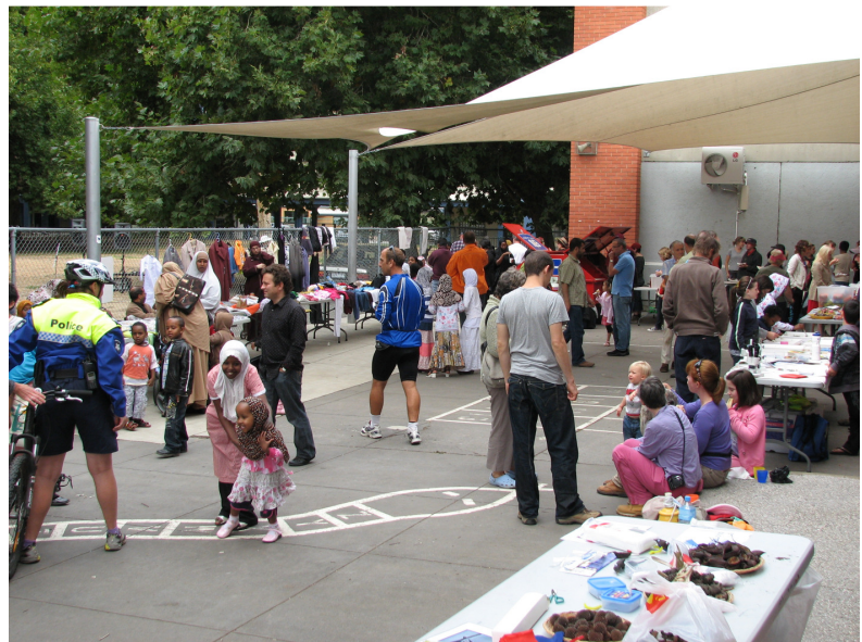
Debney Park Primary School festivities on Clean Up Australia Day

During this process the respective Local Government members of the committee, will be delivering the greening program in their municipality. The committee asks for patience during this process.