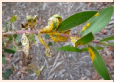
Myrtle Rust on a Melaleuca

The Department of Primary Industries (DPI) would like to advise you that the exotic plant disease myrtle rust has now been identified in nine commercial nursery premises, mainly in the metropolitan region of Melbourne and one on the Mornington Peninsula. As yet, there have been no detections in the natural environment.