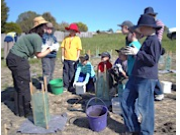
Steph explains some techniques to some Oak Park Cub Scouts, September 2007