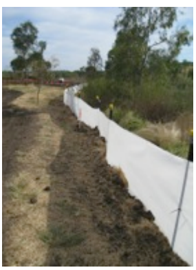
The frog fence