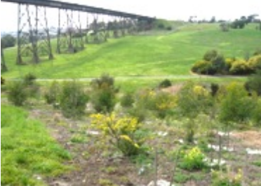
Looking across the valley in September 2008 and the same view in February 2012