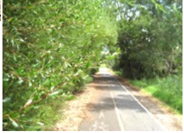
The group's planting days were always very well attended, often with the Oak Park Cub Scouts lending a hand and joining in the fun.