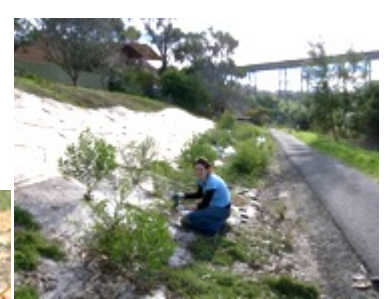
Looking north to the viaduct June 2003 and the same site in February