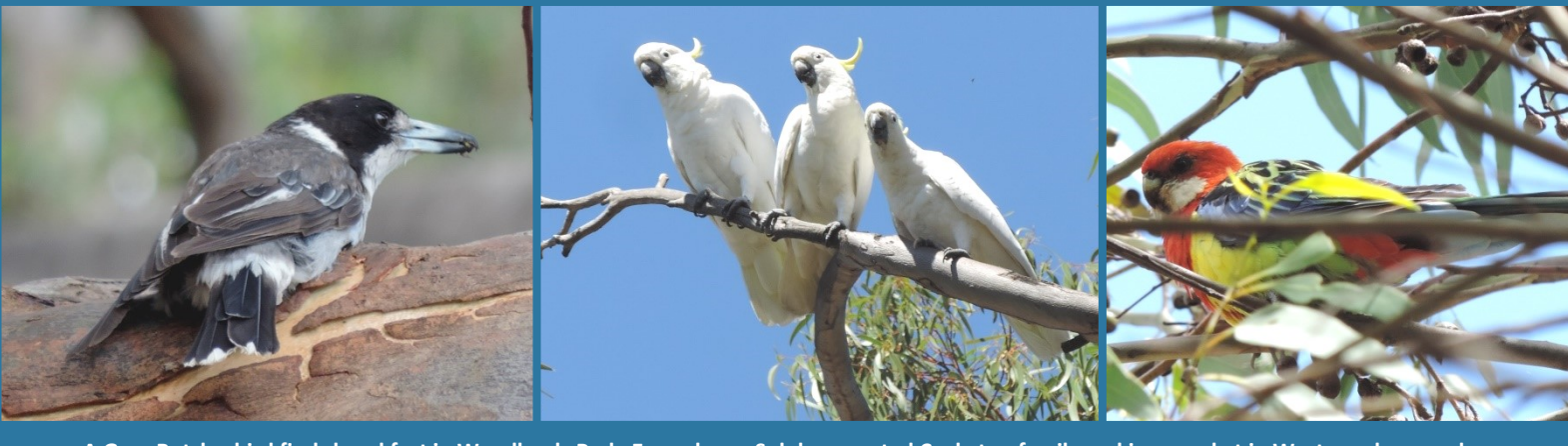
A Grey Butcherbird finds breakfast in Woodlands Park, Essendon, a Sulphur-crested Cockatoo family making a racket in Westmeadows and an Eastern Rosella tries to hide at Boeing Reserve, Strathmore Heights.