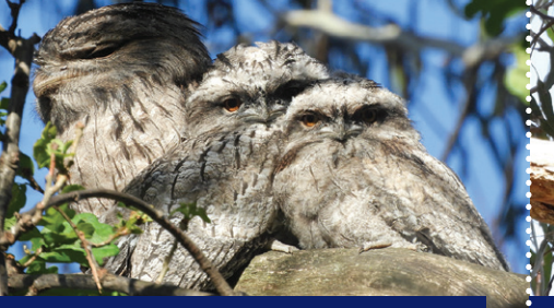
Westbreen Creek Pascoe Vale