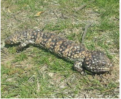
A Shingleback Lizard found by Andre Braakhuis at Woodlands