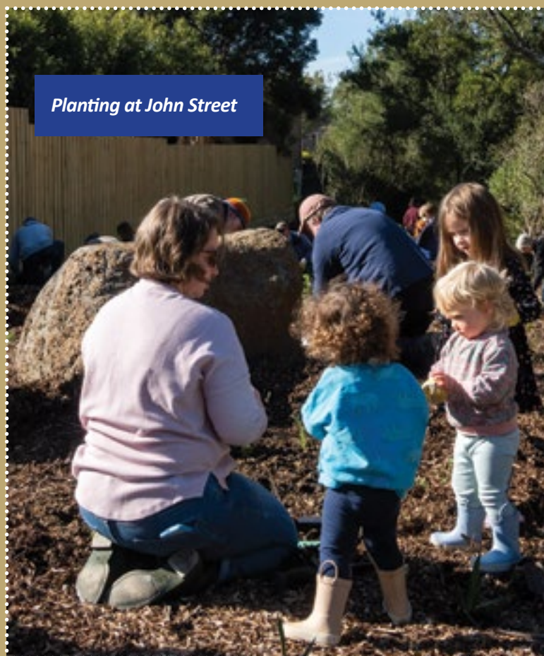
Planting at John Street

A big thank you to everyone who came out to plant at John Street with us in the sunshine on Saturday August 10! Lots of Friends and locals were there to plant over 800 indigenous seedlings and celebrate the completion of this new open space. Landscape works include improved creek access, revegetation areas, drink fountain, informal seating and a bluestone labyrinth providing a beautiful and restful location to spend time in along the creek.