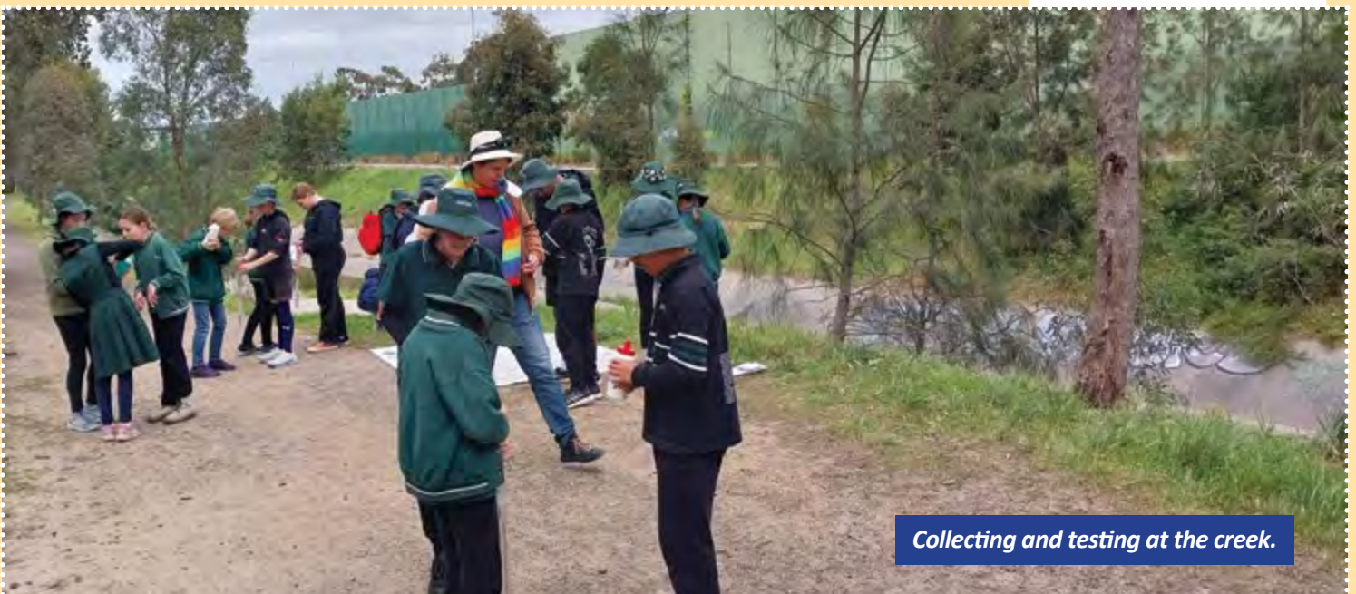
Collecting and testing at the creek.