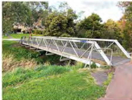
Moonee Ponds Creek Bridge (Boeing Reserve Strathmore Heights to Deveraux St Oak Park)