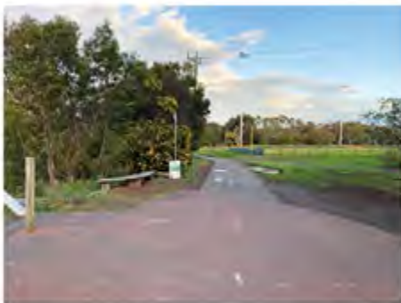
Moonee Ponds Creek Trail looking south from the bridge at Boeing Reserve, Strathmore Heights (Stage 1)