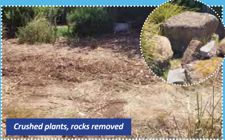
Crushed plants, rocks removed

Without warning, on Tuesday 12 November, Jemena subcontractors dug up, moved landscaping rocks and piled over a garden bed, then removed plants and tossed them in a pile over other plants, before driving a heavy vehicle back and forth across the area. This was followed by more heavy vehicles on 15 November and further damage as an electricity pole was being replaced and secured.