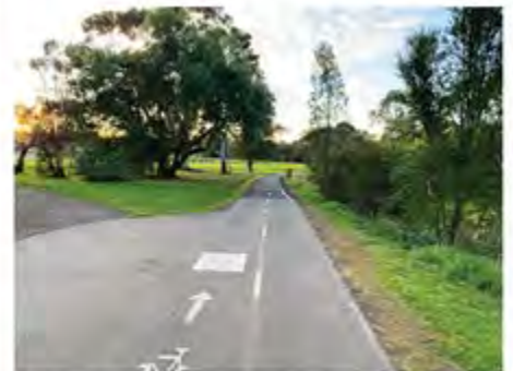
Moonee Ponds Creek Trail looking north from the bridge (Stage 2)