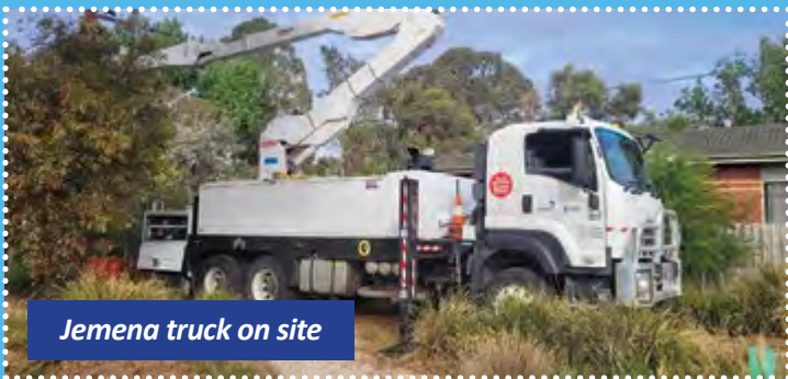
Jemena truck on site

It is understood that power poles need replacement but surely some consultation with relevant agencies, such as Council, regarding minimising the impact of their actions is not too much to ask of Jemena.