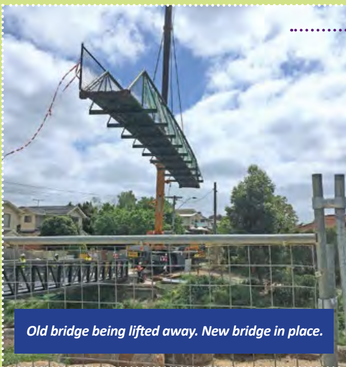
Old bridge being lifted away. New bridge in place.