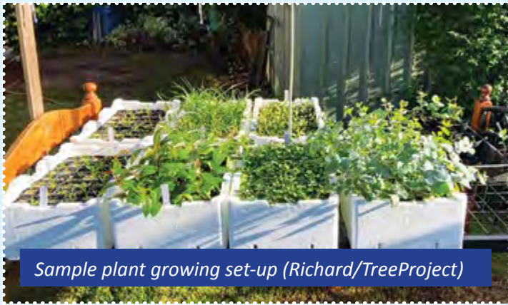
Sample plant growing set-up (Richard/TreeProject)

The TreeProject is a volunteer, not-for-profit organisation that has been operating since 1989 to provide low-cost indigenous seedlings to landholders and Landcare groups. The aim is to help restore Victoria's soil, waterways, vegetation shelter belts and wildlife corridors by assisting revegetation projects. Millions of seedlings have been planted to date. Many plants grown by TreeProject volunteers have assisted in the restoration of bushfire affected areas.