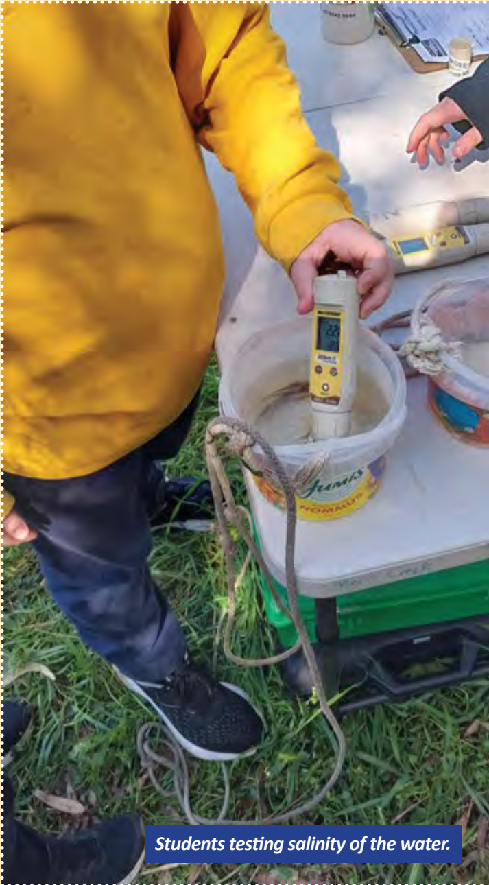
Students testing salinity of the water.

The students collected and tested water just at the end of the new area on the MP Creek where the concrete was removed. It was exciting for the students, staff and myself to get up close to the new area where large rocks and plants have been planted into the creek. As this section was not open to the public when we were there, we all felt special getting a sneak preview! On day 2, we noticed a whole lot of detergents coming into the creek, most likely coming through the storm-water system. Detergents can be toxic to aquatic life and remove oils from ducks feathers, meaning ducks protective barrier from cold and damp is removed.